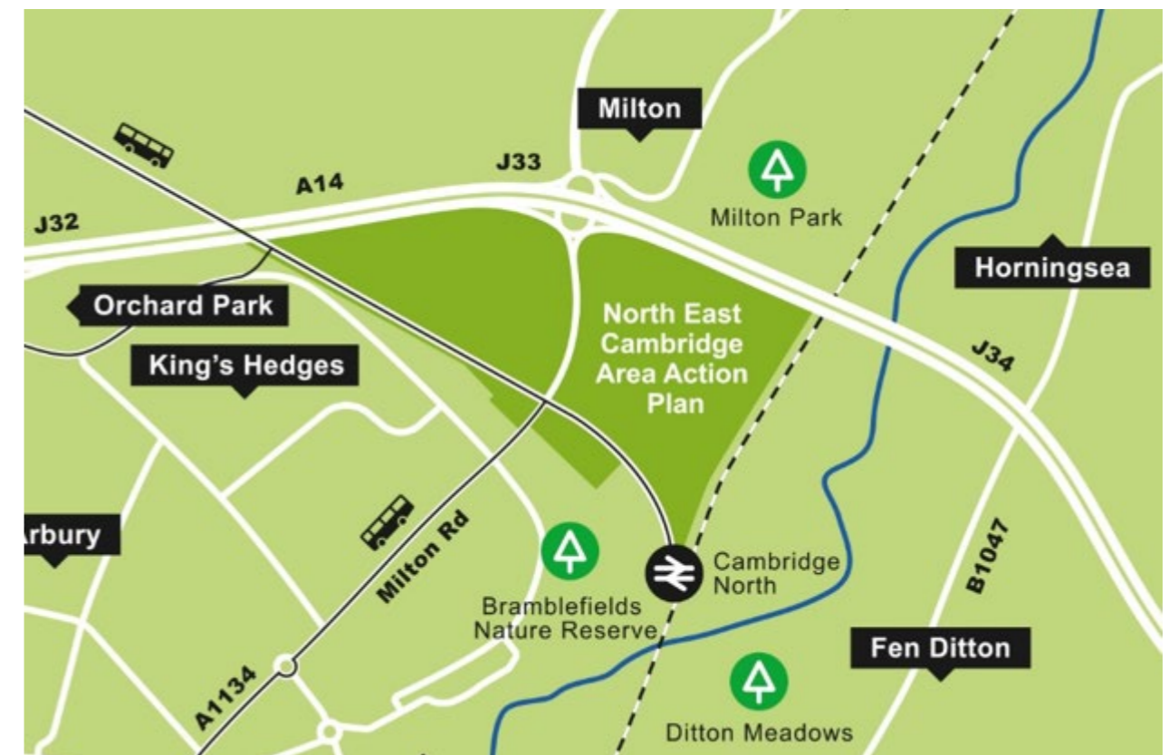
Source: Draft NEC AAP Consultation Document, 2 June 2020